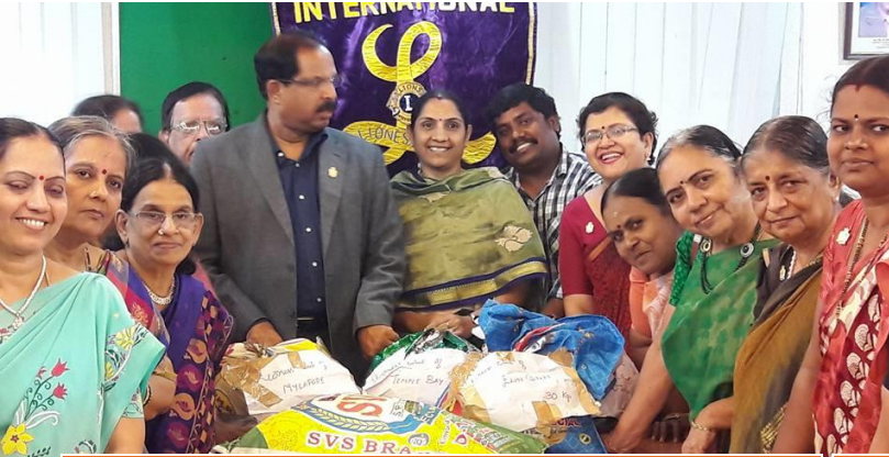
"Outreach to Village Homes" Program – Raising rice for under-privileged people in surrounding villages