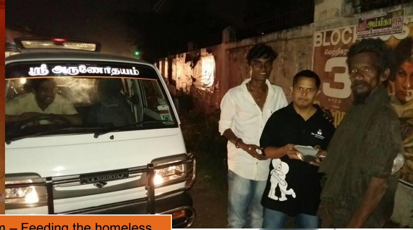
"Share a Meal" Program – Feeding the homeless