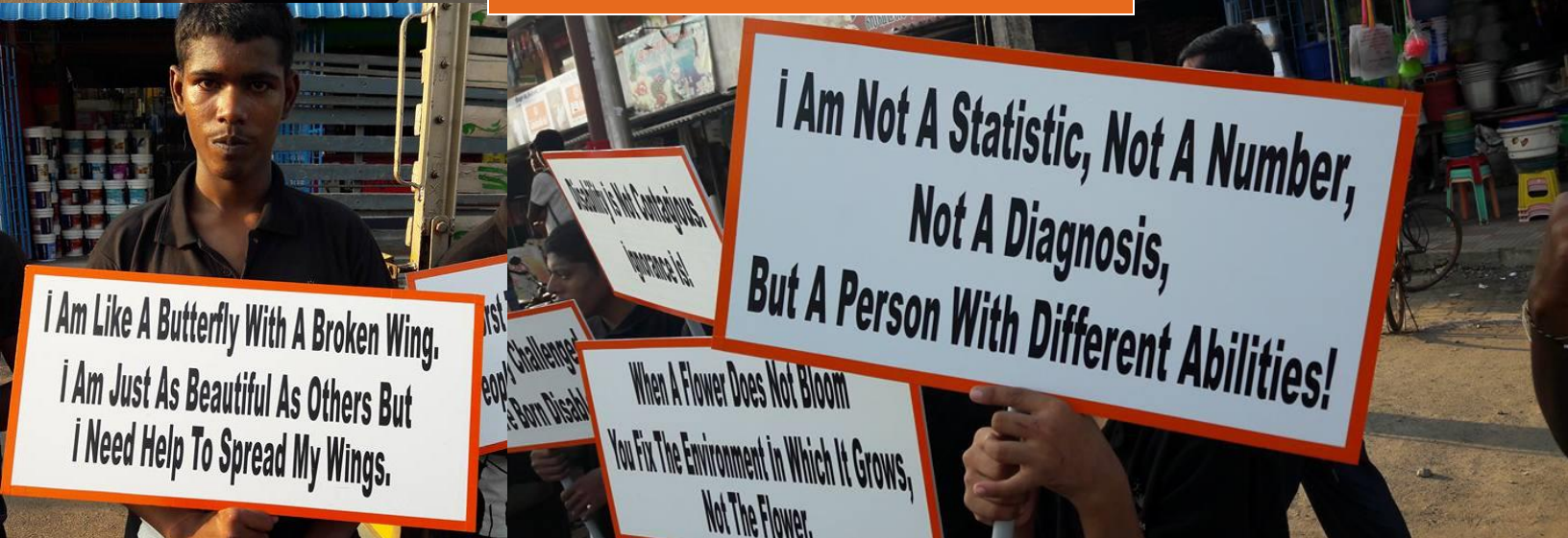
"Rally for a Cause" Program – Creating awareness about the mentally challenged among the public

i Am Like A Butterfly With A Broken Wing. i Am Just As Beautiful As Others But i Need Help To Spread My Wings.