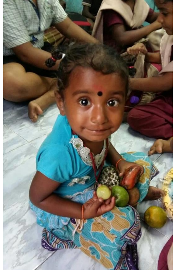
“Fruit on Friday” Program – Sharing fruits with Gypsy and Irular Children

“Give and you shall receive, much more than you ever thought possible. People who give will never be poor.” – Anne Frank