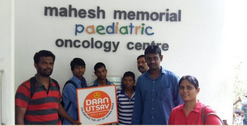
"Teach a Skill" Program – Sharing skills with young mothers in distress