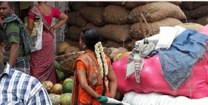
Koyambedu fruit and vegetable vendors join our campaign